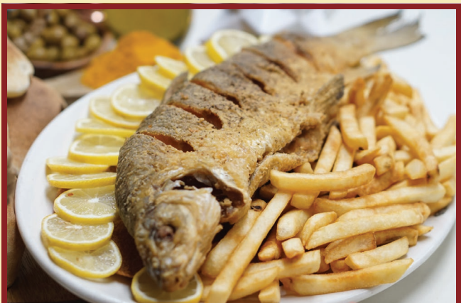
FRIED LAKE WHITE FISH 🍷 ... (MARKET PRICE) Whole Bone-In Fish Served with Fries or Rice and Salad