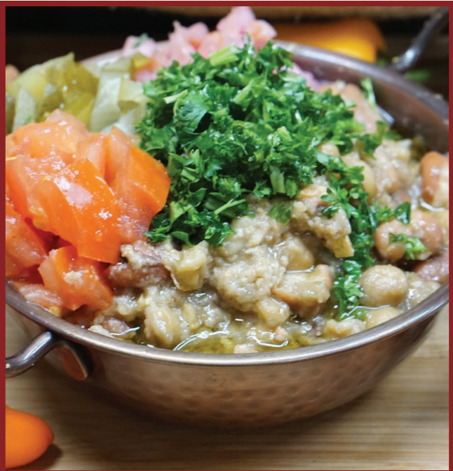
FOUL MUDAMAS 🌱 .. MED $10.99 • LG $14.99