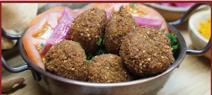
FALAFEL 🌿 .....$10.99 Fava Beans Mashed with Chick Peas & Sesame Seed Sauce