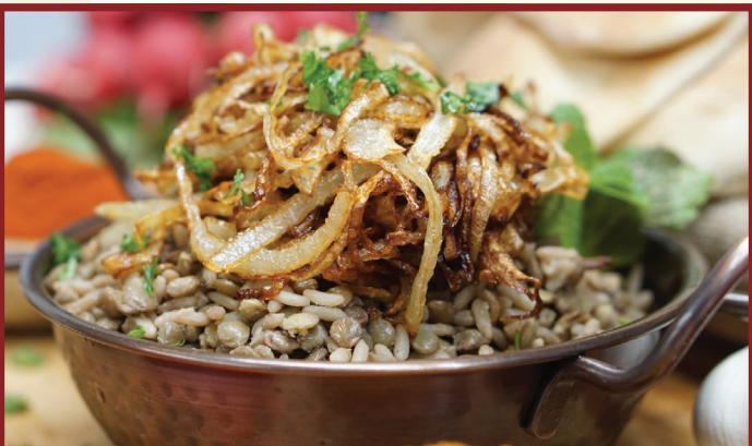
MOUJADARA 🌿 .....$17.99 Lentils & Rice, Cooked in Olive Oil & Topped with Caramelized Onions served with either Salad, Yogurt or Soup