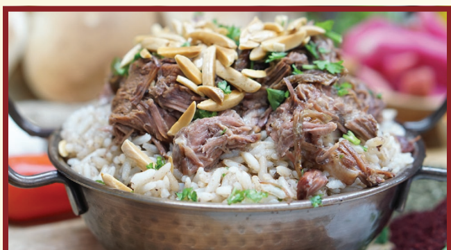
STUFFED LAMB ..... $24.99 Roasted Baby Lamb served over a Bed of Rice

HUMMUS WITH MEAT ..... MED $16.99 • LG $29.99 Sautéed Beef or Chicken Chunks topped with Almonds served over Hummus