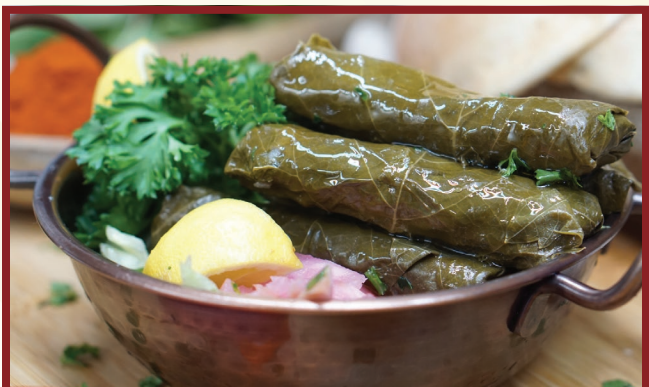
GRAPE LEAVES ..... $16.99

* RAW KEBBIE WITH HASHWI 🍷 .... $21.99 Raw Kebbie topped with Ground Meat & Onions