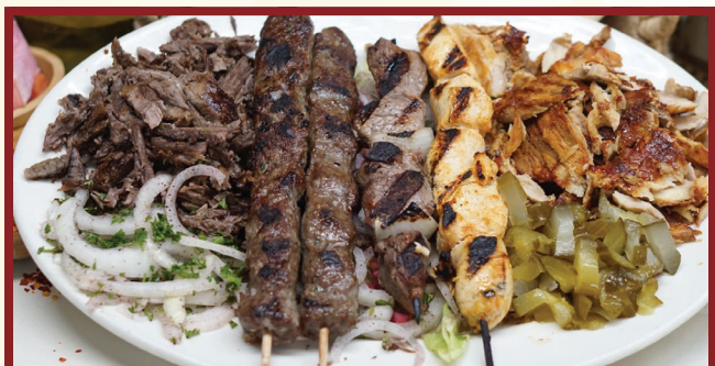
* AL-AMEER PLATTER ..... $38.99 Chicken Shawarma, Meat Shawarma, Tawook, Kabob, 2 Kafta, Served with your choice of Two Sides (Serves 2)

ARAYES ..... $17.99 Toasted Pita Bread stuffed with Ground Meat & Almonds, Served with Yogurt or Salad